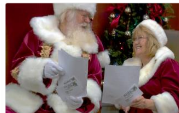
Santa and the elves are getting ready!