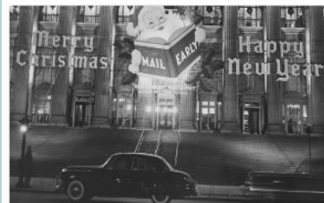
In pictures: The story of the U.S. Postal Service delivering the holidays